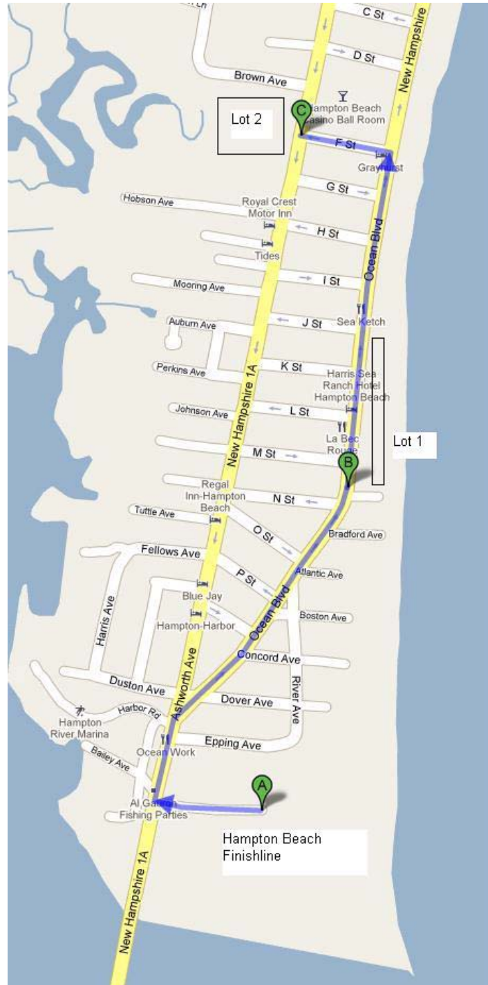
Fig 14.1 – Directions from the finish ‘A’ to parking Lot 2 (C).