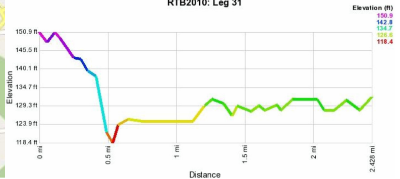
RTB2010: Leg 31