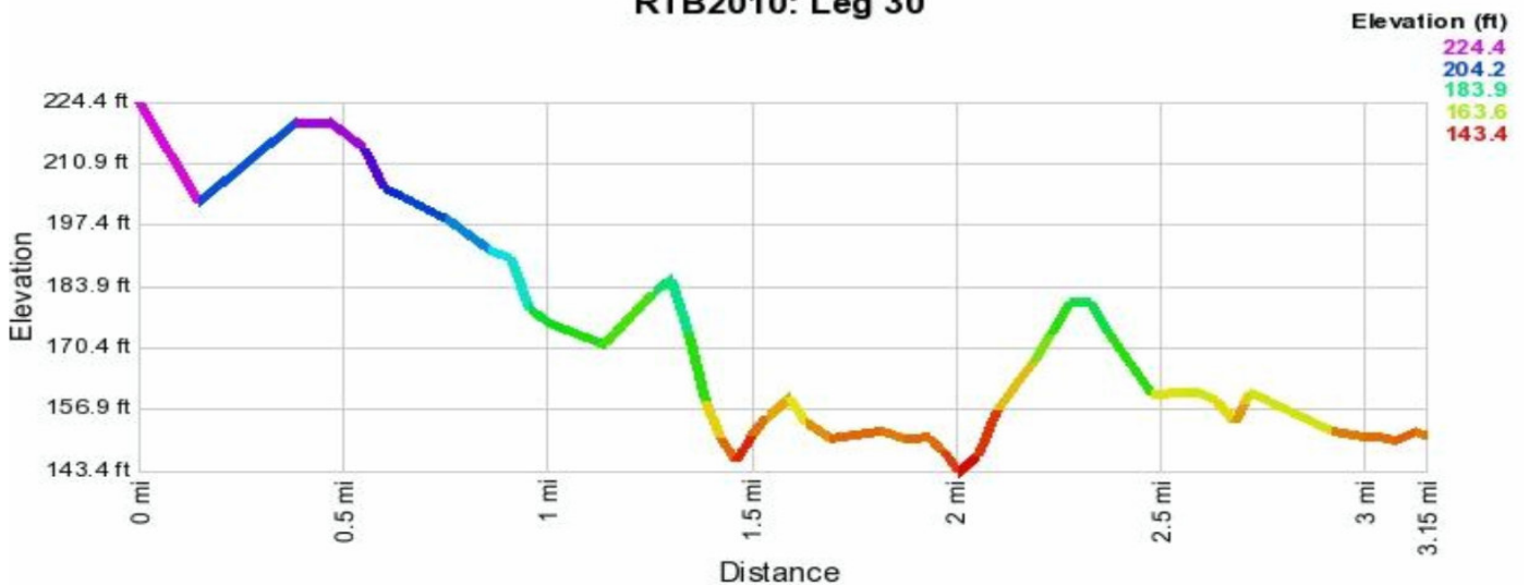
RTB2010: Leg 30