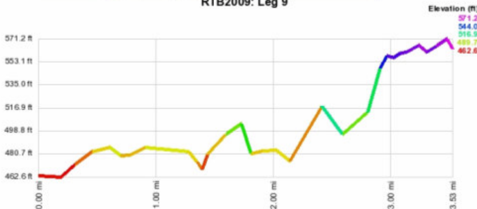
RTB2009: Leg 9