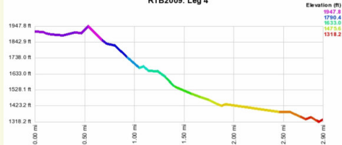
RTB2009: Leg 4