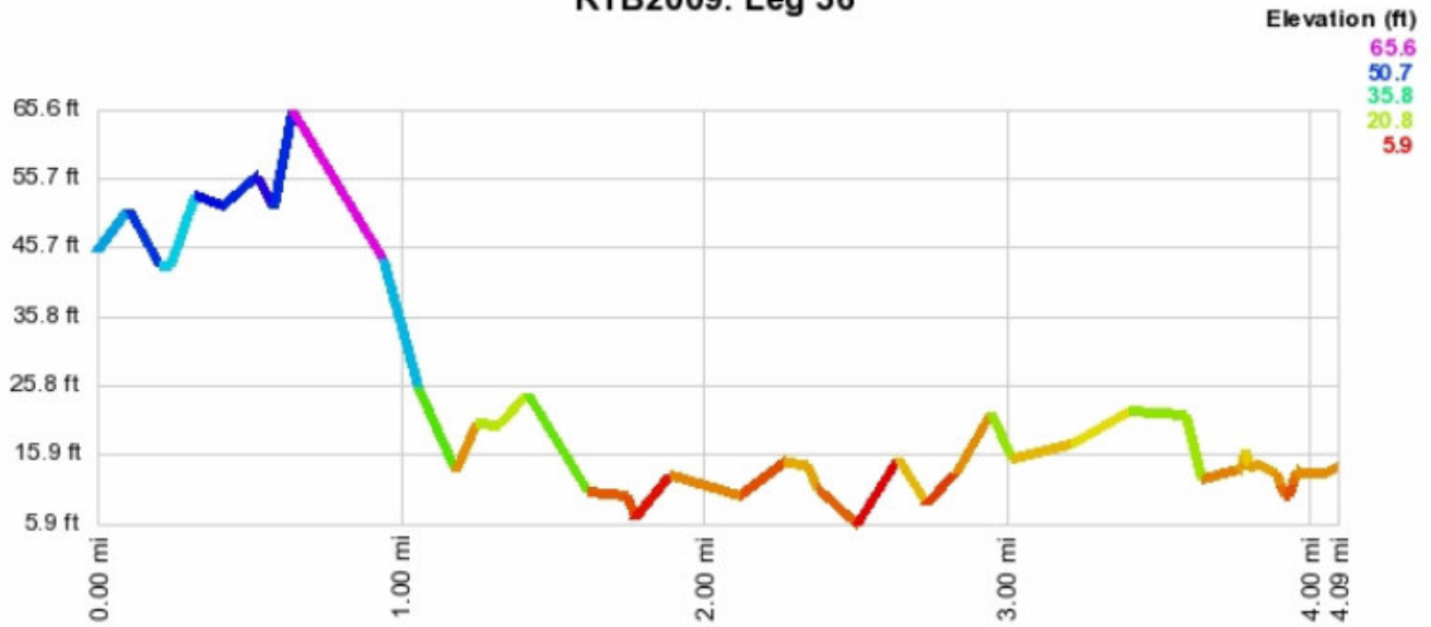
RTB2009: Leg 36