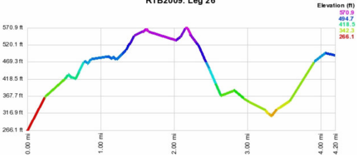
RTB2009: Leg 26