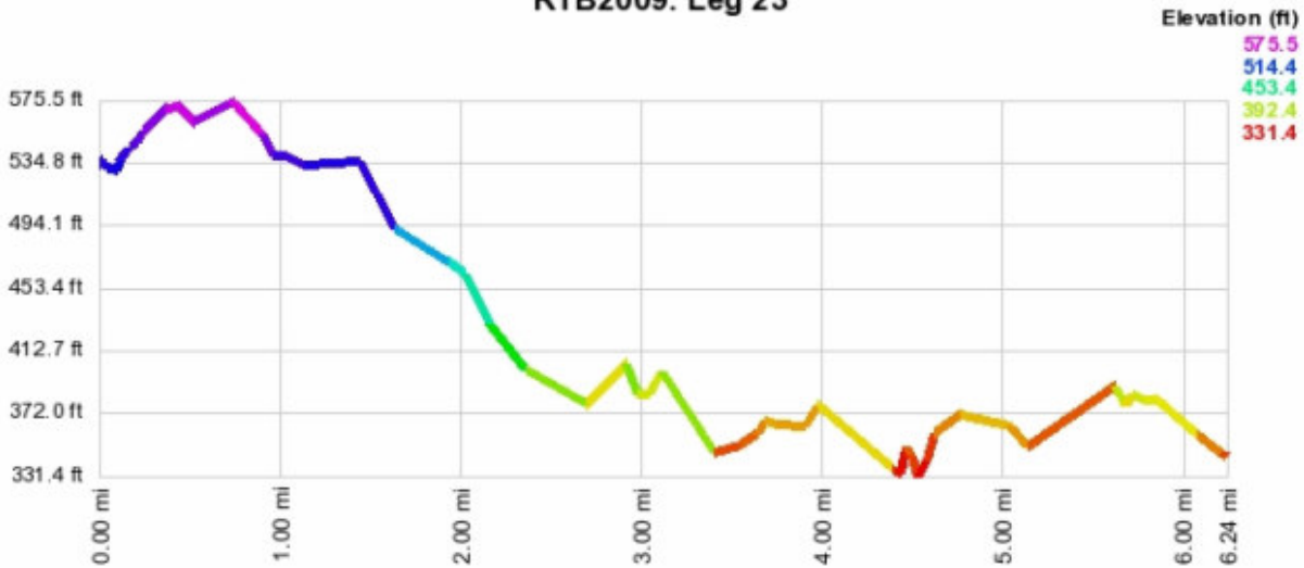
RTB2009: Leg 23